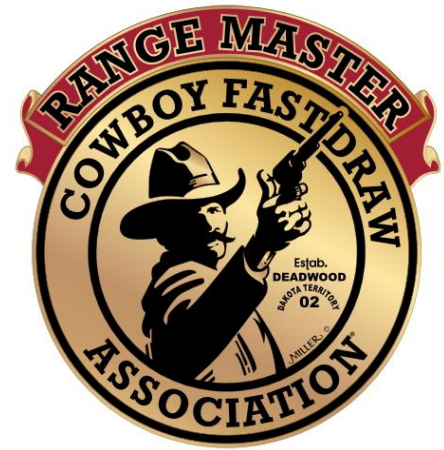
At CFDA Titled Events