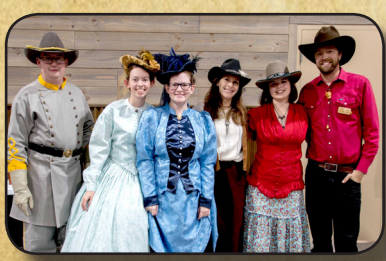
THE COWBOY WAY is alive and well here!

TO LEARN MORE ABOUT CFDA OR TO BECOME A MEMBER. GO TO: